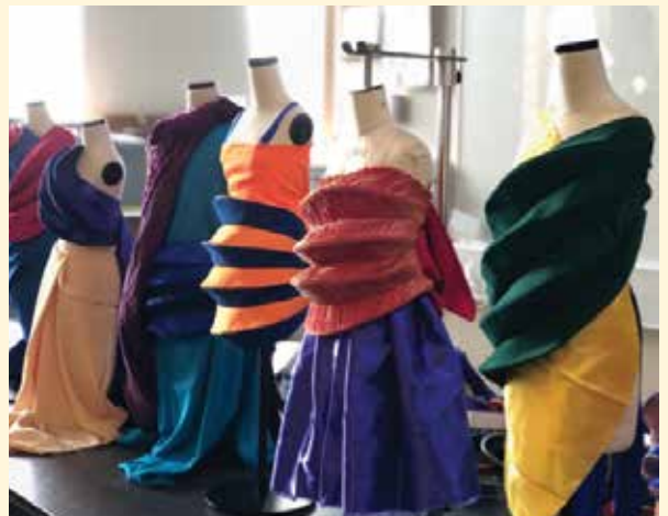
Moquettes from students produced in an hour in the costume department at the Royal Opera House, Purfleet.

All students exceeded our expectations with the work they produced. To be entered to the Royal Opera House students were required to select three pages from