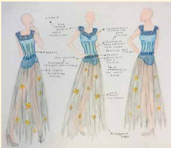
Kennedy Sanders final design for the corset she created.

their sketchbook, make an element of a product based on their design ideas and submit a 90 second video evaluating their project and finished product.