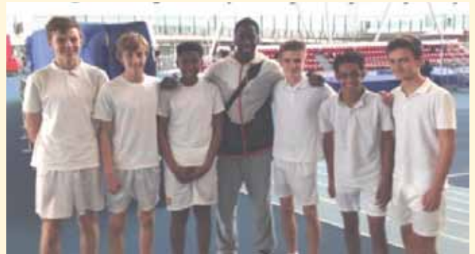
(Year 10 Team meeting Dwain Chambers)

Not to be outdone the Year 10 Indoor Athletics team competed in a series of high quality matches at the Lea Valley Athletics Centre. Picking up valuable advice from former World Champion and current British International Dwain Chambers gave the team all the confidence, help and encouragement they needed, finishing 2nd overall and qualifying for the final.