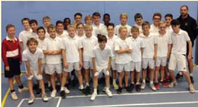
Year 7 & 8 boys Athletics Team

Often having 50 or more athletes honing their athletics skills each week, this proved to be the secret to success as both the Year 7 and 8 boys qualified for the county finals. Both teams performed exceptionally well, sprinting, throwing and jumping themselves to victory. The Year 8 team did particularly well, winning all track events while in