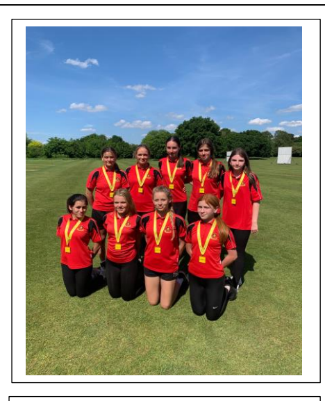
U15 Girls Cricket Team County Runners Up