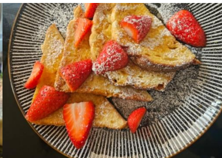
Ayden Sajid – Le pain perdu