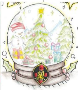
Selina W 7T1