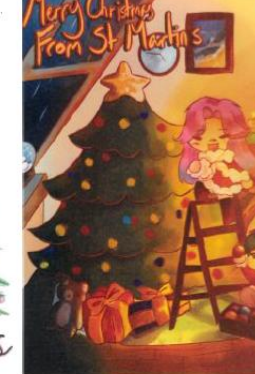
Louise B 10T1