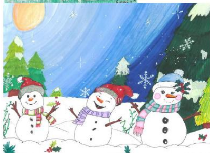
Aimee Lockwood 7S2