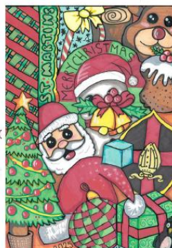
Avery M 7T2